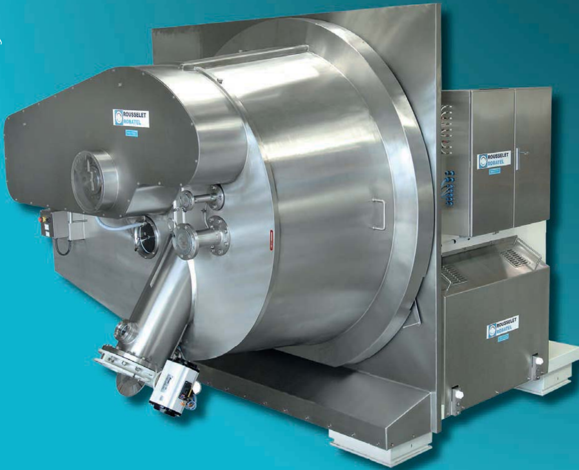
EHL 1663 DRG